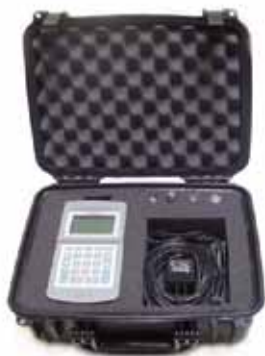
Optional Hard Case 6015-1003