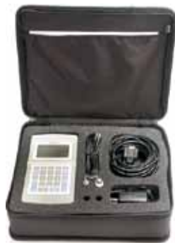
Optional Soft Case 6015-1002

For a complete and current list of testing adapters, terminations, and other accessories visit www.aeatechnology.com/products/accessories